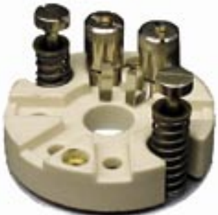
Spring Mount Terminal Block