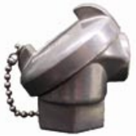
Die Cast Aluminum Heads