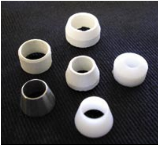
Replacement Glands are available for our adjustable Compression Fittings listed above.