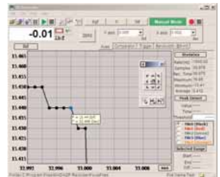
ZP Recorder screen showing zoom feature.

Specifications subject to change without notice.