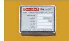
41 x 25 x 51mm