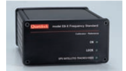
105 x 30 x 125mm