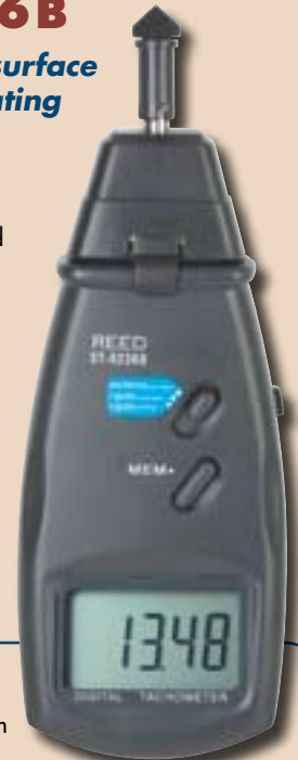
Photo Range: 5 to 99,999 rpm Contact Range: 5 to 19,999 rpm Surface Speed Range: 0.05 to 1,999 mpm Accuracy: \pm(0.5\% + 1 \text{ digit}) Sampling Rate: 1/second Dimensions: 6.3 x 2.8 x 1.5" Weight: 7.9 oz