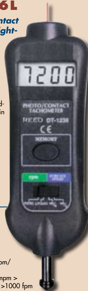
Photo Range: 10 to 99,999 rpm Resolution: 0.1 rpm ≤ 999.9 rpm; 1 rpm > 1000 rpm Contact Range: 0.5 to 19,999 rpm Resolution: 0.1 rpm ≤ 999.9 rpm; 1 rpm > 1000 rpm Surface Speed Range: 0.05 to 1,999.9 mpm/0.2 to 6560 fpm Resolution: 0.01 mpm ≤ 99.99 mpm; 0.1 mpm > 100 mpm/0.1 fpm ≤ 999.9 fpm; 1 fpm > 1000 fpm Accuracy: ±(0.5% + 1 digit) Sampling Rate: Photo: 1 sec. over 60 rpm; Contact: 1 sec. over 6 rpm Detection Distance: 50 to 2,000mm Laser: Class 2 red laser diode, 645nm wavelength Power Supply: 4 x 1.5V "AA" batteries Dimensions: 8.5 x 2.6 x 1.5" (215 x 65 x 38mm) Weight: 0.66 lb (300g)