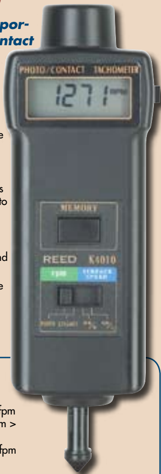
Photo Range: 5 to 99,999 rpm Contact Range: 0.5 to 20,000 rpm Surface Speed Range: 0.05 to 1,999.9 mpm/0.2 to 6,560 fpm Resolution: 0.1 rpm < 999.9 rpm, 1 rpm > 1000 rpm; 0.1 mpm < 99.99 mpm; 0.1 fpm < 99.99 fpm, 1 fpm > 1000 fpm Accuracy: ±(0.5% + 1 digit) Sampling Time: Photo: 1 sec. > 6 rpm; Contact: 1 sec. > 60 rpm Detecting Distance: 50 to 150 mm (2 to 6") typically; 300 mm (12") max. Display: 5 digit LCD 10 mm high Power Supply: (4) 1.5V "AA" batteries Dimensions: 8.5 x 2.6 x 1.5" (215 x 65 x 38 mm) Weight: 0.66 lb (300g)