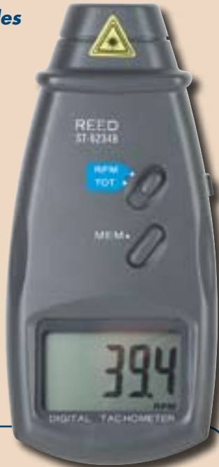
Photo Range: 2.5 to 99,999 rpm Accuracy: \pm(0.5\% + 1 \text{ digit}) Sampling Rate: 1/second Dimensions: 6.3 x 2.8 x 1.5" Weight: 7.9 oz