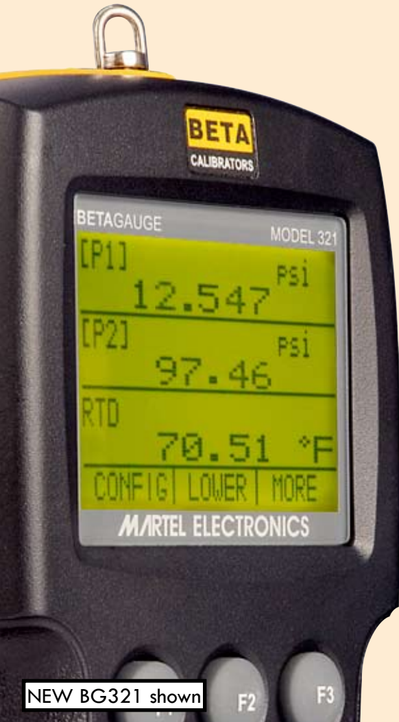
NEW BG321 shown

FOR THE CAPTURE AND CONVICTION OF AN OLDE PROMAC, MARTEL OR BETA CALIBRATOR WORKING OR NOT!