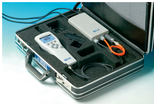
The GM70 in pump-aspirated mode is used for example to check incubators in the field.

CARBOCAP® is a registered trademark of Vaisala. Specifications subject to change without prior notice. ©Vaisala Oyj