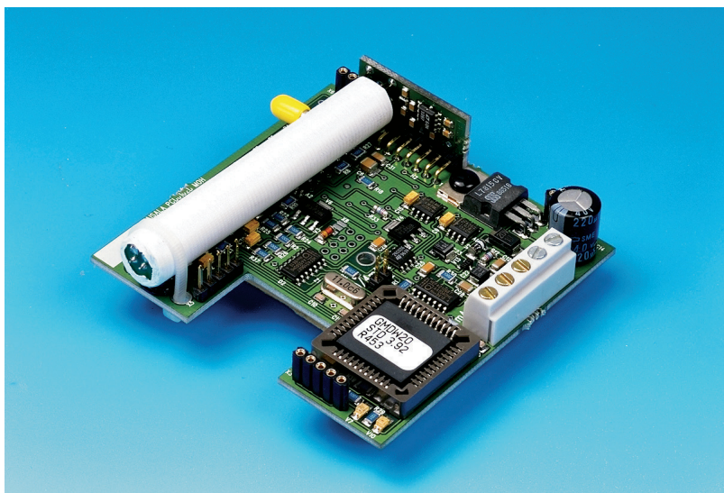
The Vaisala CARBOCAP® Carbon Dioxide Module GMM20W is designed for OEM applications in benign environments.