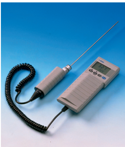
HMI41 with the HMP42 probe.