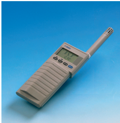
The HMI41 indicator with the HMP41 probe.