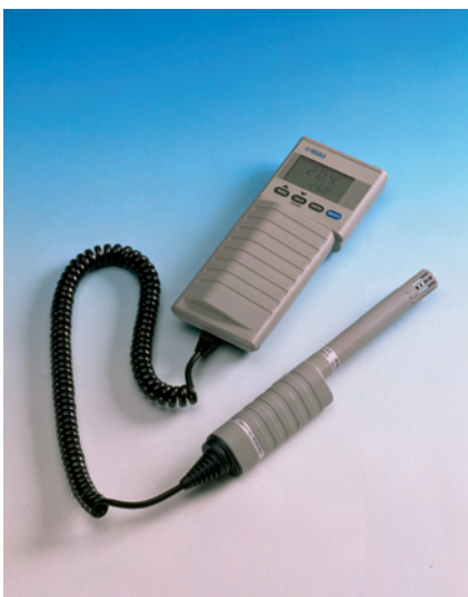
HMI41 with the HMP45 probe.