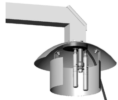
For calibration, a portable HMP77 reference probe is easy to attach beside the HMT337 probe.

Obtaining a true humidity reading is particularly important e.g. in traffic safety: at airports and at sea as well as on the roads. It is essential, for example, in fog and frost prediction.